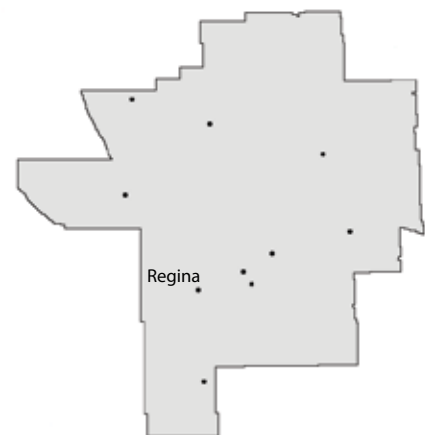
Proposed Regina Enterprise Region

Regina Regional Economic Development Authority (RREDA) is working with Enterprise Saskatchewan under their new Enterprise Region Program to create the Regina Enterprise Region. This will result in RREDA working with a region approximately three times the size of the previous region. The region will encapsulate 17,000 square kilometers and an approximate population of 220,000.