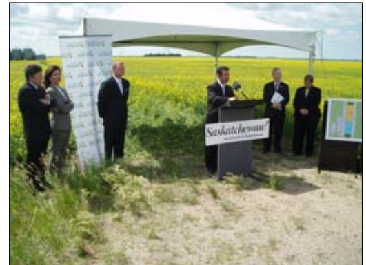
Loblaws Announcement 2008

In 2008, we saw significant development of the inland port initiative with the highlight of the year being the announcement of Loblaws Company Ltd. decision to invest $350 million into a Western Canada distribution centre of 1 million square feet and plan to hire up to 1500 employees by 2017. Loblaws has begun work on the site and intends to commence operations by mid 2010. Loblaws is working closely with CP Rail and we anticipate CP will begin construction of their new facility in 2009. Together, these investments will place Regina region in a very good position for further developments towards becoming a transportation hub.